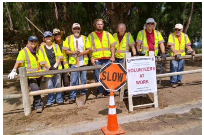
Grace Fellowship and NHA volunteers working to maintain our trails.